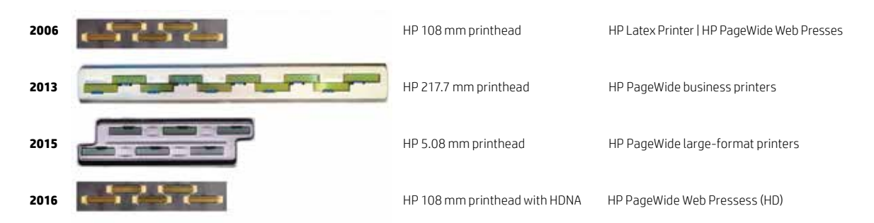
Figure 2. Four generations of HP PageWide printheads

Based on technology proven in HP PageWide Web Presses—more than 130 billion pages printed since 2008 and more than 4 billion pages per month<sup>8</sup> produced under demanding commercial printing conditions—HP's next generation of HP PageWide Technology was introduced for business and enterprise applications in 2013 with the HP X-Series business printers and in 2016 with the HP PageWide business printers. This 217.7 mm (8.57-inch) printhead incorporates significant technology advances: four colours of ink, 10,560 nozzles per colour, and 1,200 nozzles per inch for a total of 42,240 nozzles on the printhead.